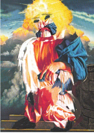
Abbildung 1: Markus Selg: Abstieg (Olymp) 2004

How the yearly exhibitions in Bavaria's capital Munich show, a rigidly drawn concept of contemporary art is obviously not even within a comparably closed region like Bavaria possible. Likewise, exhibition's of the BBK show foremost individual difference, from indifference to art history, traditions and concepts along simple adaptations up to almost delicate allusions from artworks to art as lively concept. The slogan „Malerei ist immer abstrakt“ - „Painting is always abstract“ - has to be suspicious to give a „no comment“ - label to a hidden strategy of selection without aesthetic idea. The contemporary art collection shown at the Bayerische Gemäldesammlung im Glaspalast Augsburg, may have been created following this line, with choosing the correctly queued Bavarian artist as its first criteria. Thus, the new exhibition of the Bayerische