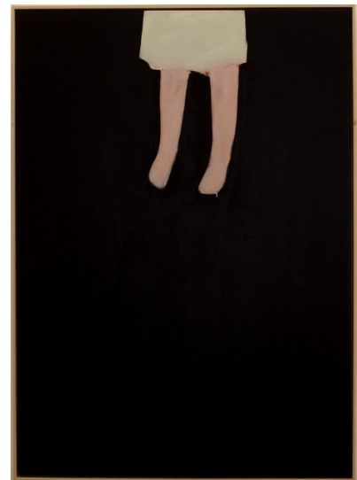
Abbildung 2: K. Daxenberger, "Beine"

Daxenberger's pictures use the art stage perhaps more convincing than Selg, who refers to tradition but himself evades it. But the reminder that our knowledge is always partial and dependent seems perhaps less necessary than the psychological subject itself. Again, the art works are not abstract enough – so to say – but cares in foreign regions without to be really needed – for showing something at the limits of things we can in social contextes talk about.